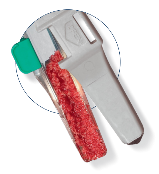
Collected bone already contains blood and is ready to use