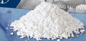
Geistlich Bio-Oss® granules are available in a variety of sizes to meet your clinical needs