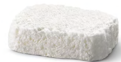
Geistlich Fibro-Gide® provides soft tissue volume and long-term stability