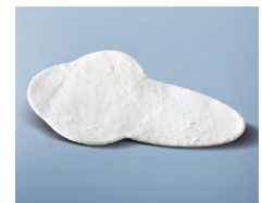
Geistlich Bio-Gide® Shape is conveniently pre-cut for clinical use which reduces preparation time

“The use of the Cardaropoli Compactor instrument helped to carefully adapt Geistlich Bio-Gide® Shape onto the inner buccal surface of the alveolus and to properly compact Geistlich Bio-Oss Collagen® inside the socket.”