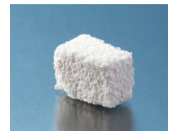
Geistlich Bio-Oss Collagen® provides the versatility needed to treat a wide range of defects

“Ridge augmentation combining the use of Geistlich Bio-Oss Collagen® and Geistlich Bio-Gide® Shape is a predictable minimally invasive regenerative procedure able to create sufficient ridge volume suitable for prosthetically driven implant placement.”