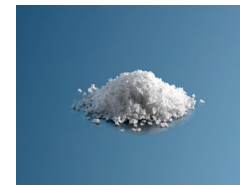
Before application Geistlich Bio-Oss® is mixed with autogenous blood or saline solution

“The importance of a quality fixation screw/system cannot be understated. Securing the graft and subsequently being able to retrieve the screw(s) without stripping or fracturing the screw head is imperative to ideal implant placement.”