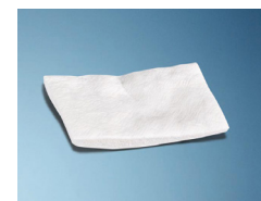
Geistlich Mucograft® is measured, cut to size and placed directly onto the defect

“Identify the problem, establish a sequenced plan and execute with equal attention to hard and soft-tissue augmentation and manipulation.”